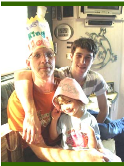
Fun father's day celebration

What would you ask for if God said I will grant you everything you ask for in the next month...? If it's all material stuff, check your heart condition. If it's all about HIS kingdom you're on the right track. Let me know how you are doing. He said, "Ask of me and I will give you the nations.." Psalm 2:8