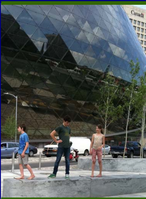
The children enjoying a bike trip to Ottawa