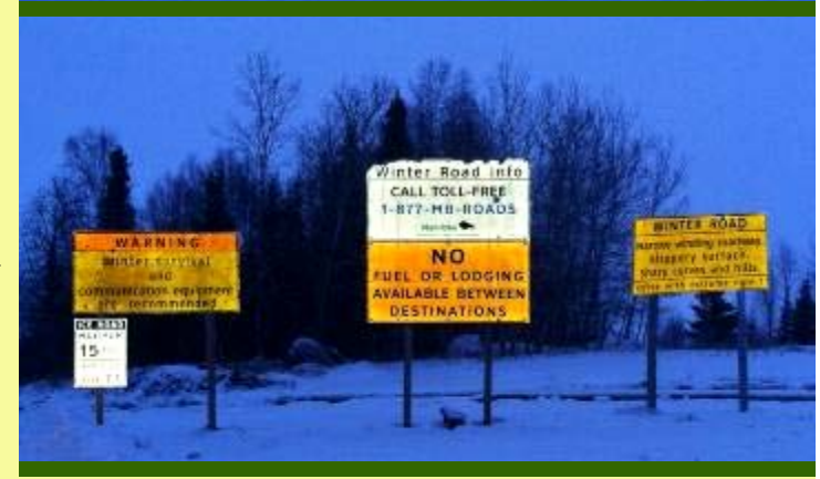
Warning signs at the winter road and ice road in MB.

of age. Pray for the believers in these Aboriginal communities. They are so dysfunctional. A tragic joke on the reserves goes like this, What do aboriginals call "Father's day"? Answer: "Confusion day" (So few people actually know who their fathers are on the reserves.) We've been invited back to the reserves when we are able and the leadership there is able to prepare for our coming.