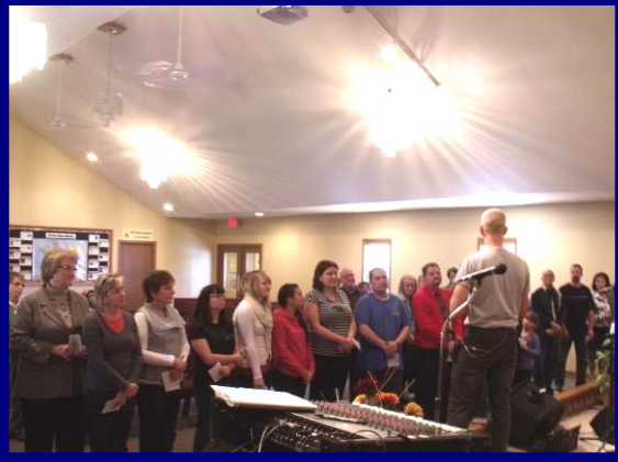
People responding to the message