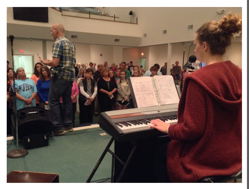
A great response in Opp, Alabama. Tour total 24 salvations/recommitments & 245 responses to message.

Another blown tire, thank God for roadside service. $2400.00 for 4 new tires.