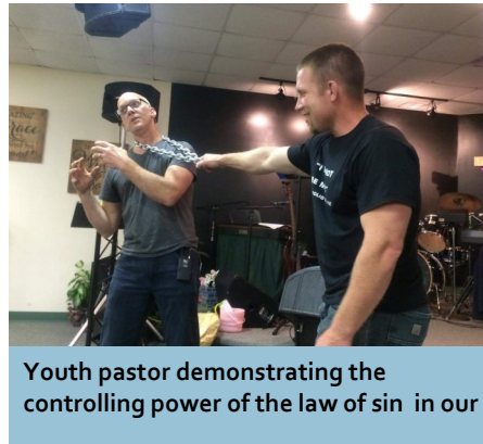
Youth pastor demonstrating the controlling power of the law of sin in our

We spoke with him for half an hour, and the visit ended with Pastor and I praying for him and encouraging him back into fellowship with other believers. WOW! God will direct us if we just allow him to direct our steps/turns.