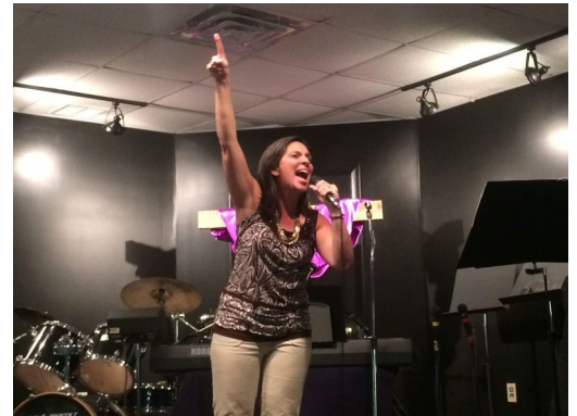
"Anger and jealousy, you have no place here I command you leave in Jesus name!"