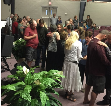
Another great response to a call for freedom in Thompsonstown PA.