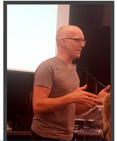
Preaching the freedom message in Belleville ON.

As I was getting ready to leave I thought to give him a hug. He wrapped his arms around my shoulders and cried and cried probably for 2 minutes. Very, very draining but incredibly rewarding. People need the love of Jesus to flow through us to them.