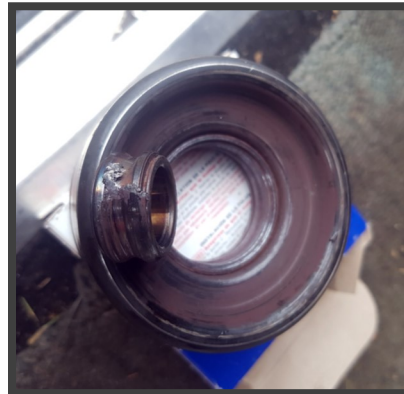
The idler pulley that lost all its ball bearings but never failed on the van. Those two pieces should be together but fell apart as Lloyd replaced this part. We travelled over 300 miles like this and we never broke down. Wow!