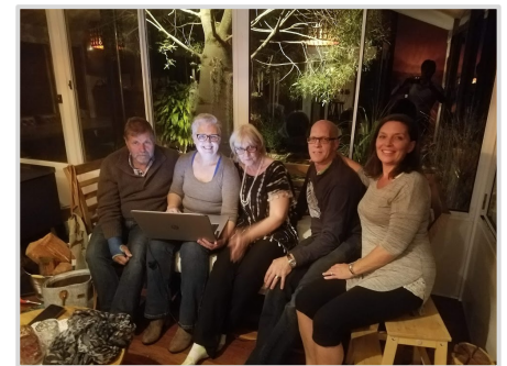
Our hosts in Australia