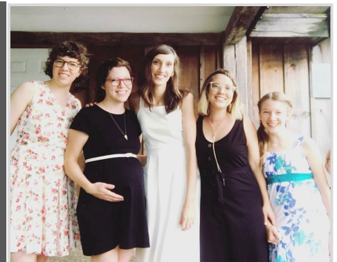
Adding a new sister to the Vandenberg clan!