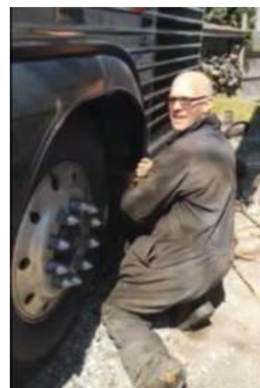
Lloyd working on the bus