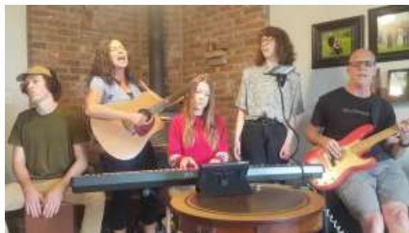
Entire family leading worship from our living room for our church's livestream

We appreciate each one of you and pray God's richest blessings on you, your families and loved ones. May the Lord bless you, and keep you, make his face shine upon you and be gracious unto you and give you peace.