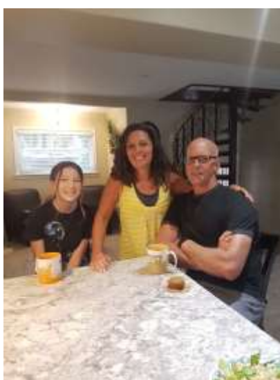
Staying home instead of touring this spring