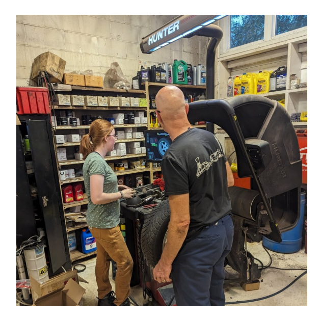
Mentoring the next generation at Organized Kaos